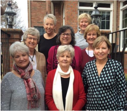
The Cookbook Committee

The Education Department celebrated raising over $3,000 from its cookbook sales to increase each annual scholarship from $1,000 to $2,000.