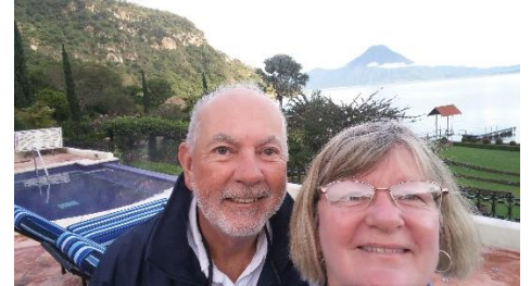
Hello from Guatemala!

Home Life Department meets the third Thursday of each month at the NBGCC. Location and time for November will be announced at November's meeting.